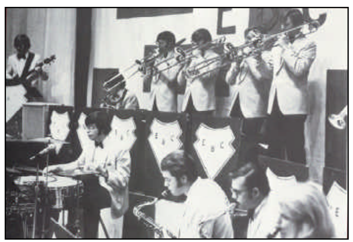
31st Annual EBC Hit Parade 1972

During this same academic year, many campus offices, including presidencies of the senior class and that of the student council, were held by EBCs. Members were active in the work of organizations like the campus dramatic club, the college newspaper and honorary groups. The biggest elective honor