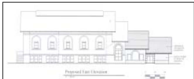
Graichen Gymnasium Upgrade and Addition

Kolstoe Hall Renovation 18 August 2003 - 11/20/03