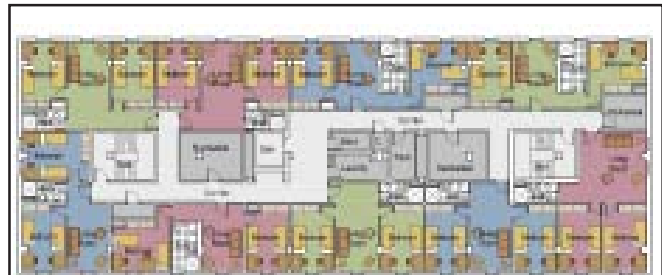
Kolstoe Hall Renovation Project

This renovation project, which is part of the Valley City State University Master Plan, will meet the needs of today's students who consider comfortable and private student housing an important factor in selecting a college.