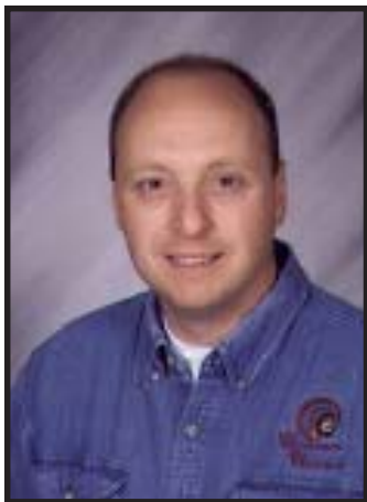
VCSU Alumni President