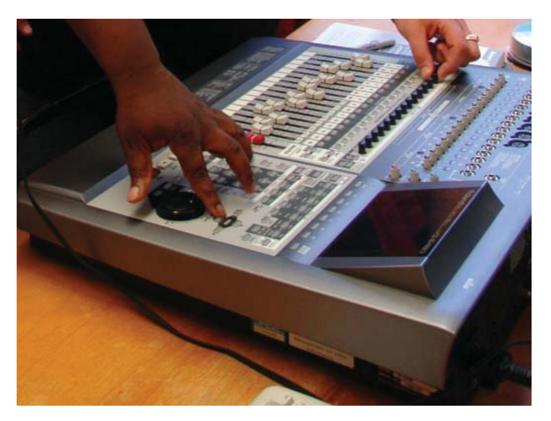
Among the facilities VCSU can offer its students studying music business: a Roland VS-2480 Hard Disk Recorder – a digital version of the "big boards" you might find in an older style recording studio. Students use it to record, edit, and burn professional-quality music CD's.

"We are different from the music industry program at Moorhead State in that they are primarily into the recording engineering